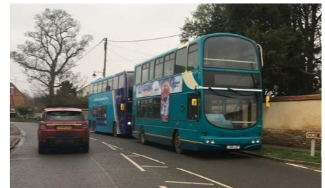
Buses queue in Haddenham