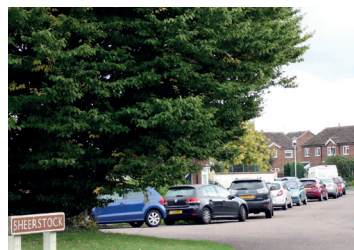
Weekday parking problems at Sheerstock, Haddenham