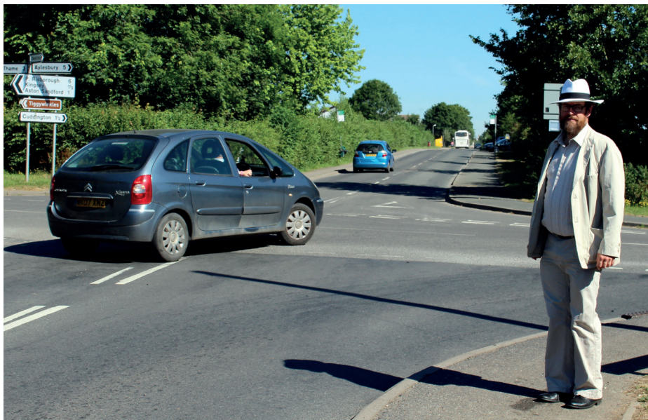
David Lyons at the crossroads of Stanbridge Road and Woodways, Haddenham

David Lyons says a 20mph speed limit in residential areas would reduce danger from speeding cars and improve residents' quality of life in narrow and congested village streets. "The parish council wants to erect a permanent vehicle-activated sign on Stanbridge Road , a particular speeding hotspot, but is awaiting a response from Transport for Bucks for a utilities search."