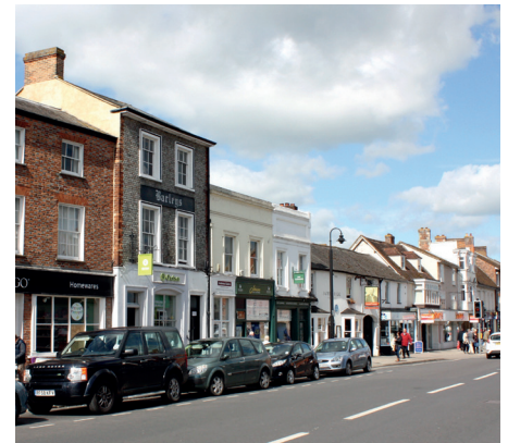
Thame High Street